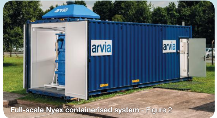
Full-scale Nyex containerised system - Figure 2