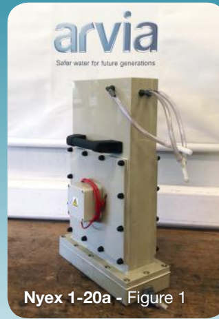
Nyex 1-20a - Figure 1

Successful removal of the phenol content was achieved ( see figure 3 & 4 below ). Recommended next steps are to install a Nyex™ treatment system prior to the bio plant treatment process at the client's facility to protect this treatment step from the damage caused by this compound.