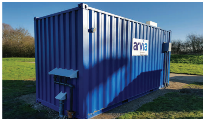
Fully containerised Nyex Treatment System on site at Anglian Water

Arvia's Nyex Treatment Systems combine adsorption with electrochemical oxidation in a single, scalable unit. Contaminants are concentrated on the surface of Arvia's proprietary adsorbent media, which is non-porous with high electrical conductivity. This patented media allows for targeted and continuous oxidation. Unlike granular activated carbon, Nyex media is effectively regenerated in-situ and the process can continue without interruption or replacement.